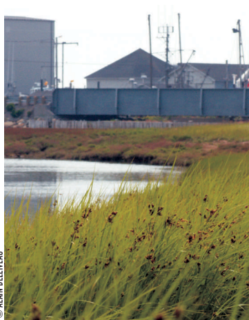
Gulf of St. Lawrence Aster